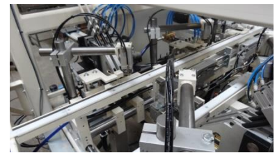
Inside the machine