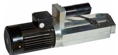
Unit with servo motor