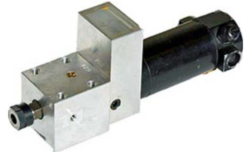
Single spindled unit