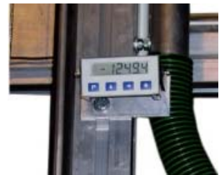
Digital Read Out