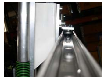
Bearing and Guiding