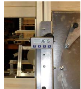
Digital Read Out